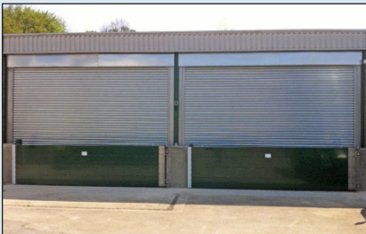
Hinged Gate Containment Barrier