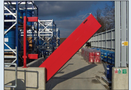
Gas-lift pivot barrier for vehicle access