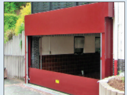
Automatic drop-down barrier