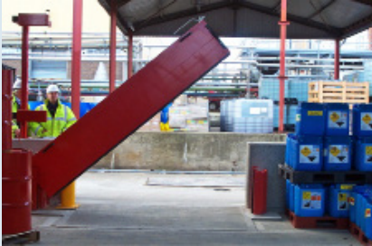
Gas-lift pivot barrier for vehicle access