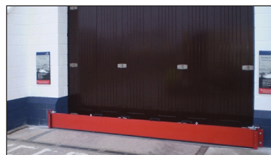
Manual containment barrier for vehicular access

A full range vent options to protect against spillages or fire-fighting run-off.