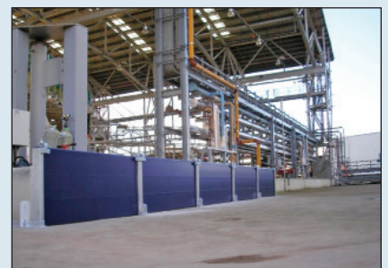
Multi-span 900mm high removable containment barrier