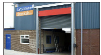
Automatic drop-down barrier